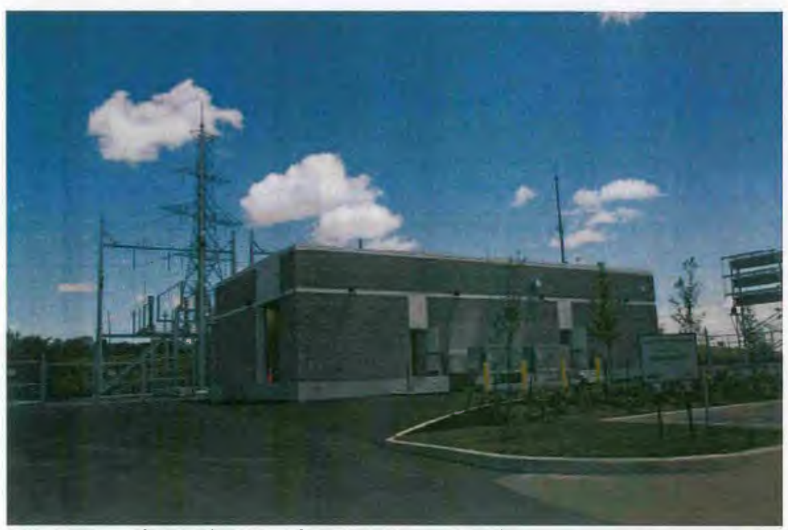
Construction of the Fabro Transformer Station in Markham was completed early in 2010. It is one of 11 transformer stations owned by PowerStream that are directly connected to the provincial transmission grid.

The Town of Collingwood and PowerStream partnership will allow COLLUS PowerStream to tap into PowerStream's experienced engineering and construction resources. This could include support in areas such as system planning, asset condition assessment, standards development, station design, construction, and maintenance, Geographic Information Systems (GIS) deployment, distribution design, locates and inspections, Electrical Safety Authority Regulation 22/04 compliance, Joint Use administration, overhead and underground construction (including civil work), OEB inspections, as well as maintenance and inspections programming for field assets.