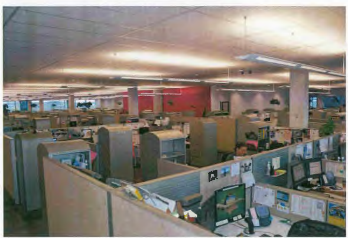
PowerStream's Customer Contact Centre answers nearly 300,000 customer calls each year and is structured to handle ever-increasing call volumes while still providing service levels which exceed the regulated requirements.

PowerStream has adopted a model for customer care which leverages strategic partnerships with a third party contact centre to help manage fluctuations in customer inquiries; both seasonal (unusually hot summers) and situational (postal strikes, regulatory changes, etc.). This model for customer care allows PowerStream to be more nimble in managing internal staff resources, improves customer satisfaction, ensures regulatory compliance and introduces redundancies in contact centre systems and services.