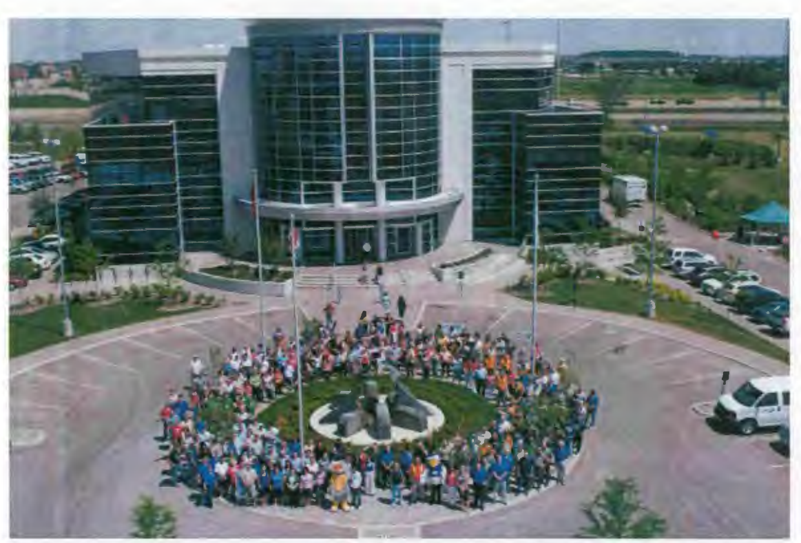
PowerStream employees gather outside the company's head office in Vaughan for a group photo following the annual Joint Health and Safety Barbecue.

Response to COLLUS Power RFP for Strategic Partnership SECTION 3.2 – 3.7 November 16, 2011 Page 10