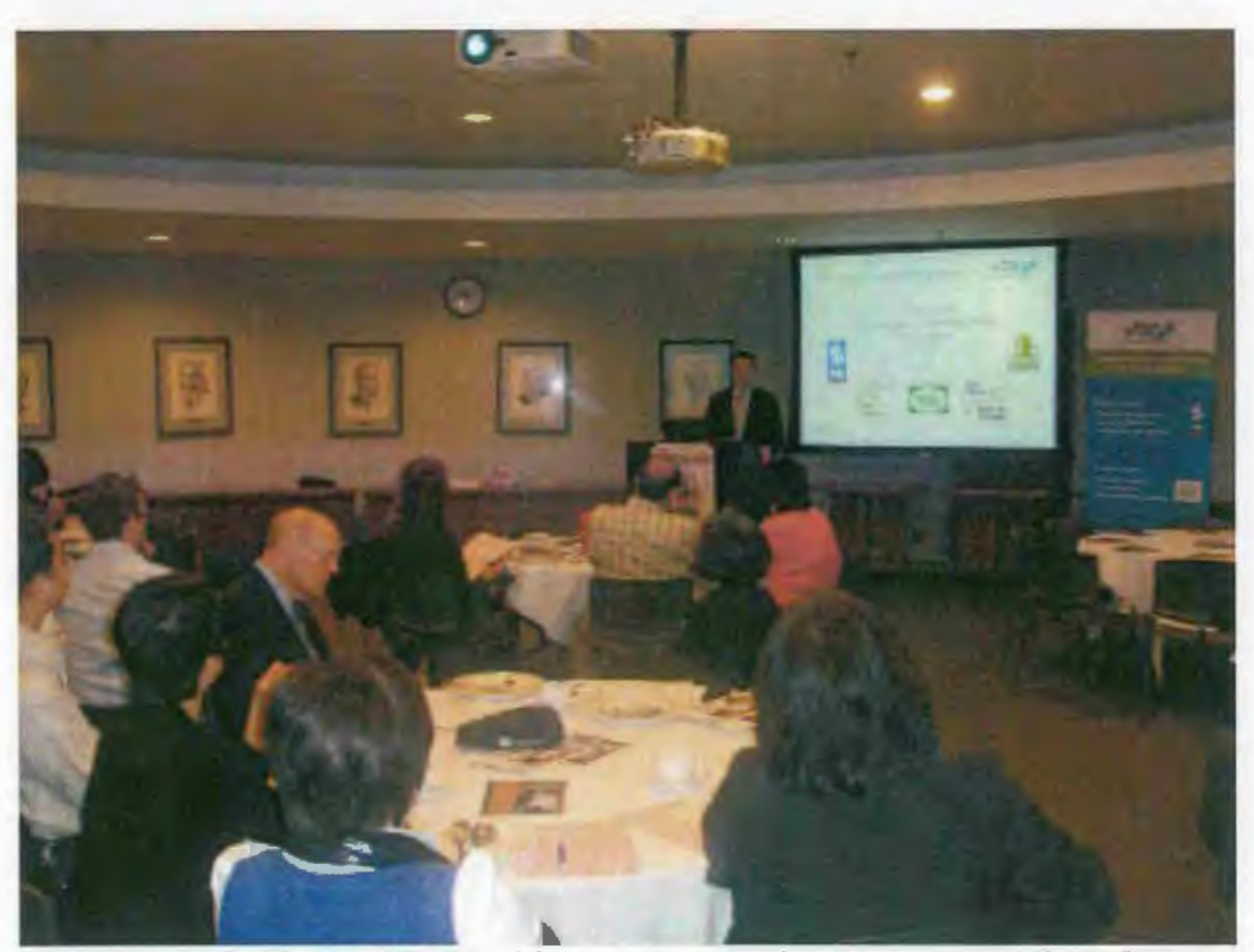
PowerStream holds periodic breakfast meetings with representatives from key account customers to provide them with information on various programs and services offered by the company.

PowerStream has an active key accounts customer-centered program for large users, sensitive loads and municipal partners which facilitates the delivery of individualized and tailored services to these customers. PowerStream has established a similar key account approach within the engineering group for specific residential and condo developers that streamlines project management for large developments. PowerStream anticipates COLLUS PowerStream will be able to take advantage of the key account approach that PowerStream has established by leveraging the key accounts program within the COLLUS Power service territory.