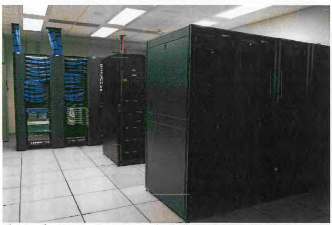
The main data centre at PowerStream's head office in Vaughan connects to the company's two operations centre through fibre optic technology.

location. Should COLLUS PowerStream decide to make use of PowerStream's IT infrastructure, after the initial cost, the on-going costs would be minimal.