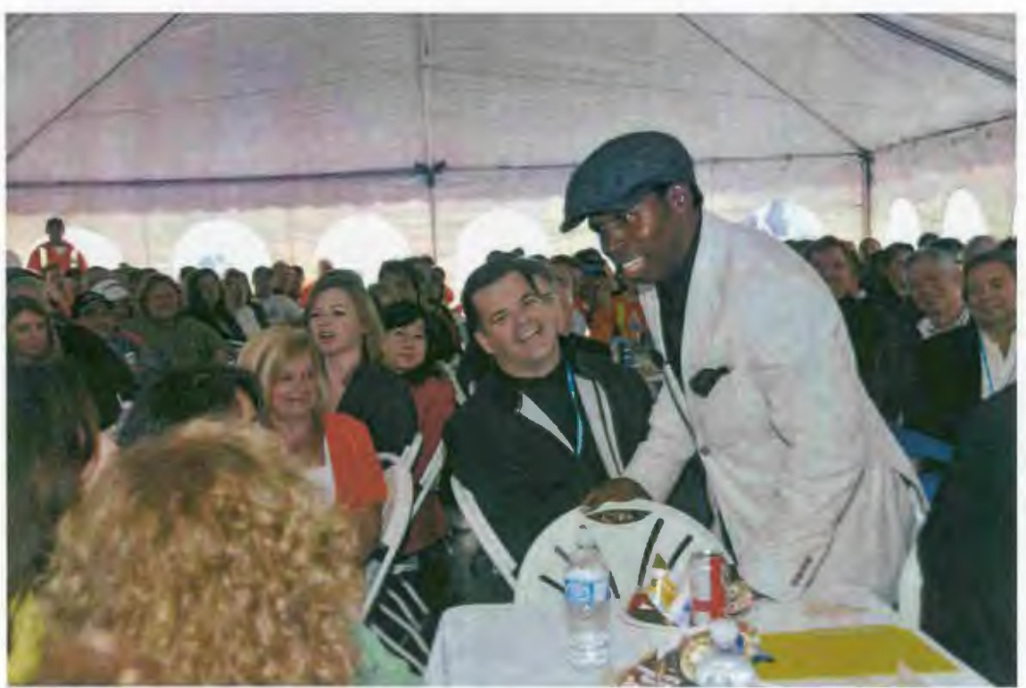
Former Toronto Argonaut running back, Mike "Pinball" Clemons, addresses employees at PowerStream's annual Joint Health and Safety Committee Barbecue.

Other added values may include the establishment of specific Health and Safety targets for all levels of staff in monitoring safety meetings, safety meeting attendance, site inspection performance or the ongoing training of employees in areas such as WHMIS, vehicle driving, CPR, AED, rescue practice and fire drills.