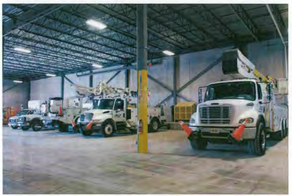
The indoor parking garage at PowerStream's South Operations Centre in Markham has room for 45 large trucks.

COLLUS PowerStream would benefit from economies of scale on capital purchases, materials, fleet and other contracted services.